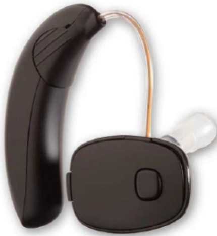
Click image to open expanded view